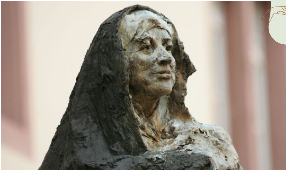
Image of Mary Ward Mainz General Chapter 2021

MR Introduction and welcome! To avoid 'Zoombabble' we ask that you stay muted throughout the service. This means you can make all the responses - and sing along with abandon! We have drawn on long-established liturgies, such as Iona, WOC and others, with gratitude.